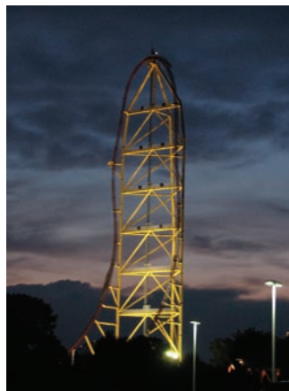
Top Thrill Dragster