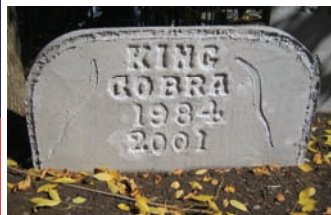
These guys just love riding the King Cobra (RJ)